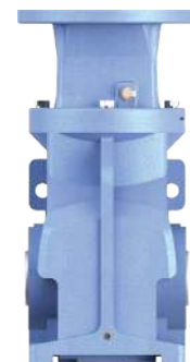
Foot Mounted Design