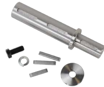
KHN Single Output Shaft Kit Double Output Shaft Kit also available

Need a shaft output helical bevel gear unit? WorldWide Electric also offers a single and double output shaft kit that mounts directly into the KHN series hollow bore helical bevel gear reducer. Reduce your inventory cost and stock more output options with KHN shaft kits.