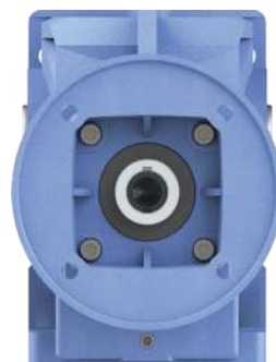
NEMA Quill Input Flange