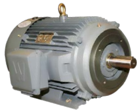
WorldWide Premium Efficient C-face Motors 1 – 600 HP TEFC Enclosure wwec.co/CFPW

The WorldWide Electric WINL Series Reducer is designed to be compatible with all C-face motors, including WorldWide and Hyundai C-face Premium Efficient Motors.