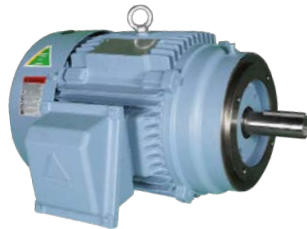
HYUNDAI ELECTRIC Hyundai Premium Efficient C-face Motors 1 – 200 HP TEFC Enclosure wwec.co/HPEM